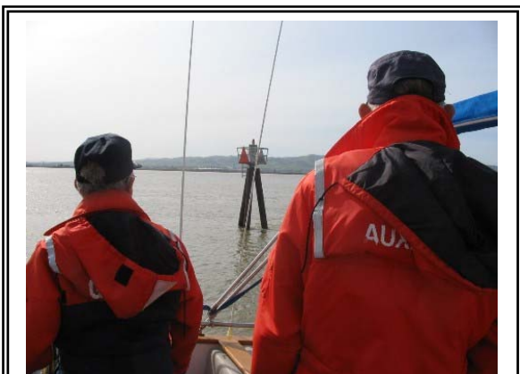
Students are shown local ATONs

Flotilla 57 has conducted several sessions over the last five years, but has picked up the op tempo in June 2005. The flotilla has conducted seven separate OWST missions since then. The most recent was May 5 th . Auxiliary facility 38454 String O' Pearls has been the primary platform for embarking the students.