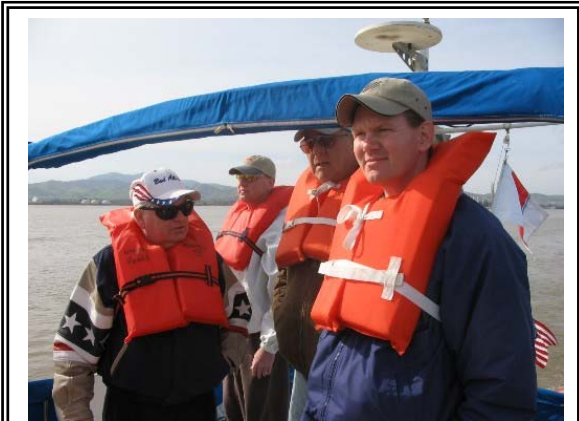
Students have donned their PFDs and are ready for class to begin

Since 2001, Flotilla 57 has engaged in the Auxiliary's "On The Water Safety Training (OWST) program. The Coast Guard has authorized Auxiliary units to conduct boating safety training with public ed students