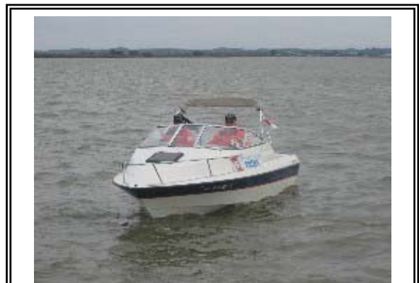
Auxiliary vessel 191069 Cygnus assists

In order to participate, students must have completed the classroom course. The lead instructor, vessel owner, and coxswain have discretion in allowing students aboard.