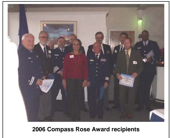
2006 Compass Rose Award recipients

The new annual award trophy, The Compass Rose, was presented to 12 Flotilla 57 members for outstanding team-spirited accomplishments in 2006. The Award was presented at the 2006 Change of Watch / Holiday Celebration held at the Benicia Y.C. on 03DEC06.