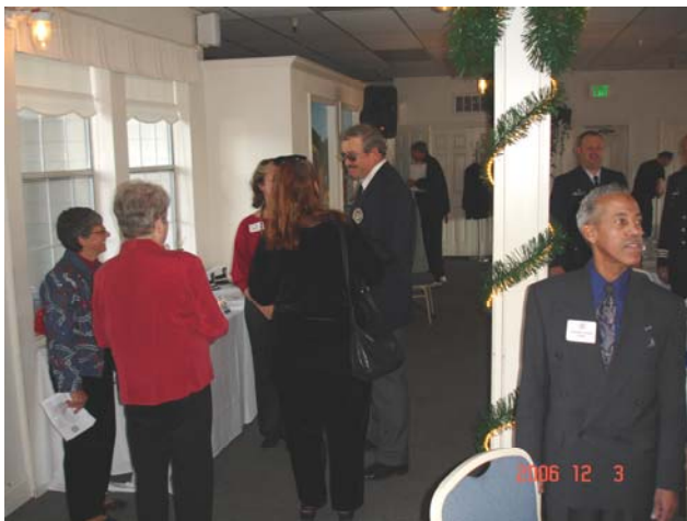
Flotilla 57 members and friends