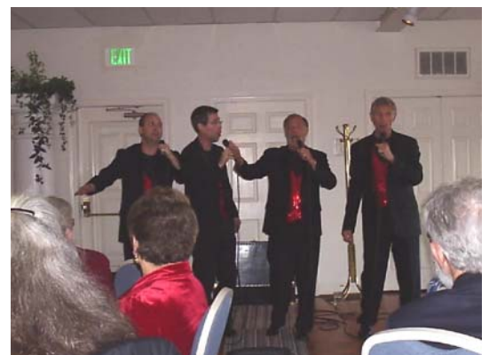
House Blend provides musical entertainment